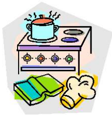
over low heat for twenty minutes