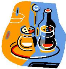
two tablespoons of whole cloves, six inches of stick cinnamon, and a pinch of nutmeg