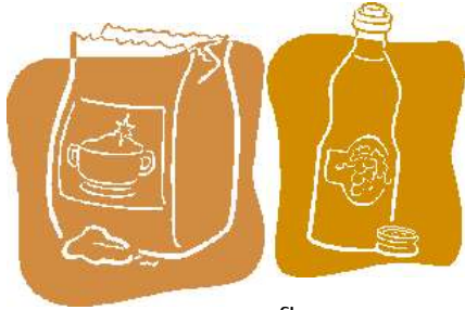
five cups of brown sugar, two cups of white vinegar

Below are the steps for making spiced peaches. Write a detail sentence for each picture below.