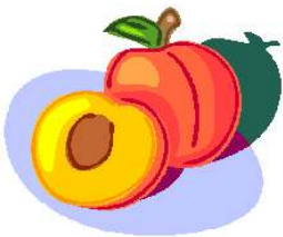
four quarts of peeled whole peaches